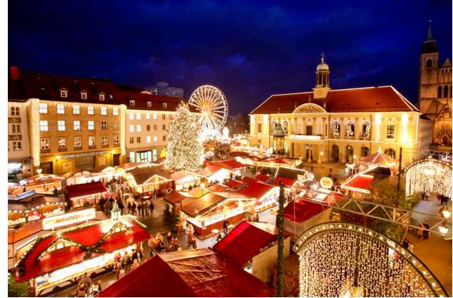
Magdeburg Christmas Market