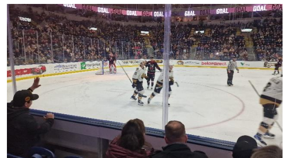
The Newfoundland Growlers hockey team shown here playing in the 2023/24 season. They are not playing in the current season.