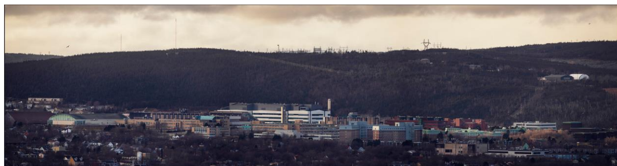
Skyline of St. John's, Newfoundland, home of our Canadian partner university, Memorial Univ. of Newfoundland and Labrador (center).