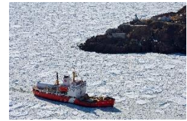
Entrance to St. John's harbour on a cold winter's day.

With a bit of luck, you'll see an iceberg passing by the coast, or at least lots of ice (see to the right). Still today St. John's gets heavy snow-fall (up to a meter at once) several times each Winter, usually bringing the city – and some times even the airport, to a standstill. This can last anywhere from a few hours to a few days and can significantly disrupt transportation in and out of the region. St. John's is on an island which it takes about 8 hours to traverse by car and where you occasionally encounter small communities.