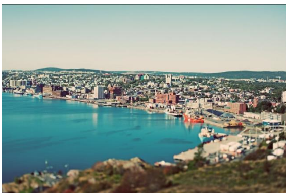
View of St. John's, Newfoundland.

St. John's metropolitan area with its population of about 213,000 is a tad smaller than Magdeburg (with a population of around 238,000). St. John's location is unique: It is a picturesque, tight-knit city nestled between a scenic harbour and the surrounding hills.