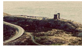
Signal Hill outside St. John's

It is the Eastern-most city in North America – the spot closest to Europe. It was for this reason that the pioneer of radio signals, Guglielmo Marconi, in 1901 chose what is today called Signal Hill (see above) in St. John's as the North American end for the first transatlantic wireless transmission.